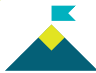
事業準備 Career Readiness